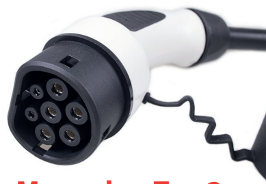
Mennekes Typ 2