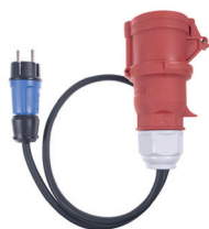
CEE 5pin 32A CEE 3pin 32A 230V 1m camp socket