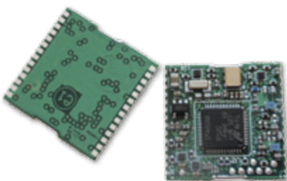
Buffalo B1919 (with shield removed)

Choose the Buffalo module for greater GNSS performance which is backed by Trimble's 30+ years of experience in providing the best positioning solutions in the market today.