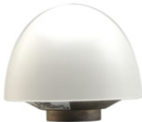
Trimble Bullet antenna (5 V with TNC connector)