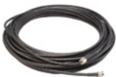
75 feet of RG-6 cable, terminated with TNC connectors at both ends

The kit is supported by the Trimble GPS Studio software (downloadable from the Trimble website). Trimble GPS Studio offers complete control, monitoring and data logging and data conversion features. The logging features can be used to create audit records to support traceability and operating status for the system. This data can also be made available to other applications including spreadsheets and databases allowing integration into other reporting and analysis systems.