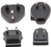
Power pin adapters