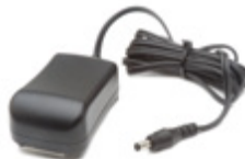
Power converter (24 V DC AC/DC)