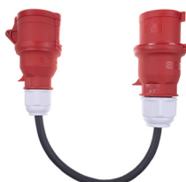
CEE 5pin 32A CEE 5pin 16A IP44