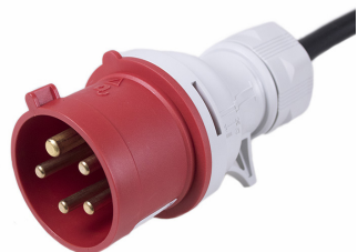
CEE 5pin 400 V